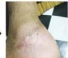
服用三个月后 / Taking Gamat Asli after 3 month