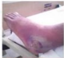
手术前 / Before operation