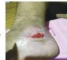
服用一个月后 / Taking Gamat Asli after 1 month