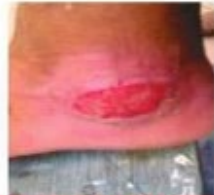
服用两个星期后 / Taking Gamat Asli after 2 weeks