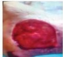
手术后 / After operation